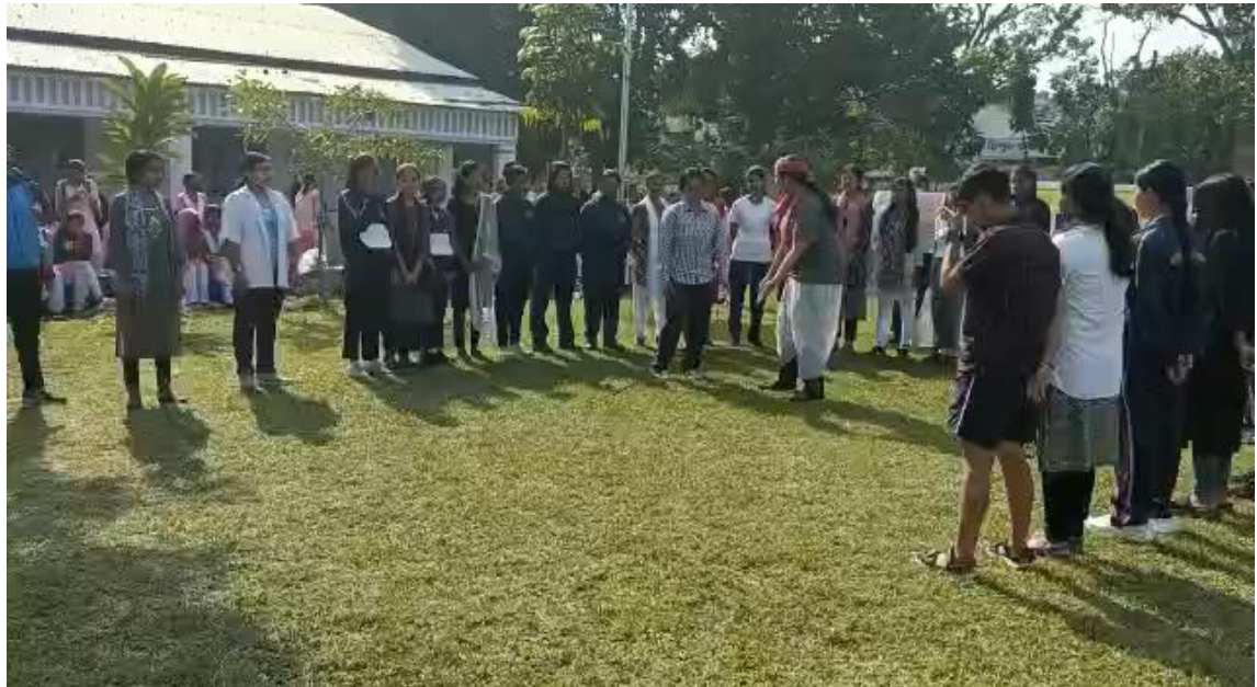
Figure 2 Nukkar Natok on effect of Plastic.