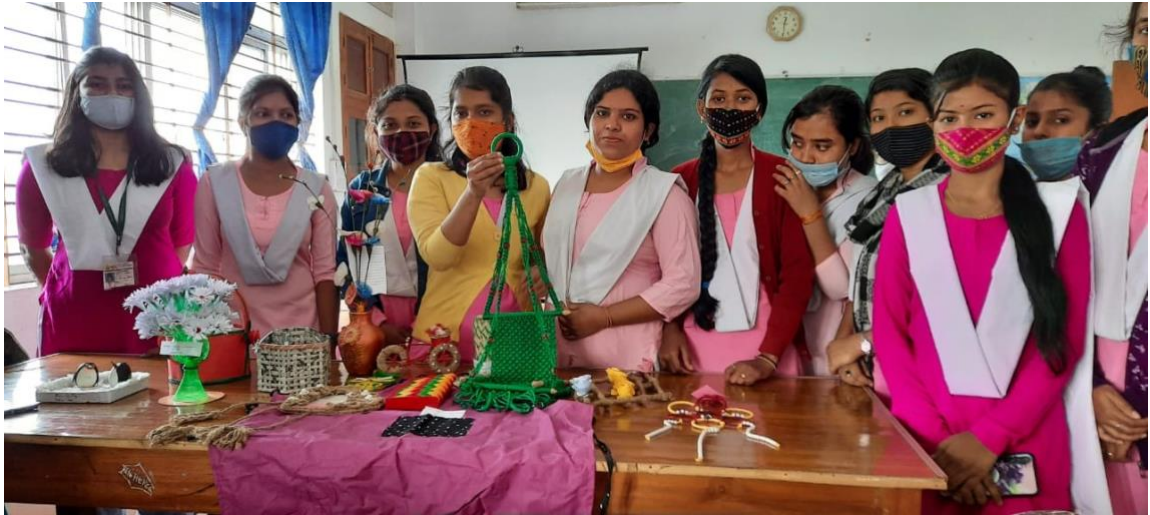
Figure 1 Best out of Waste- a training session.