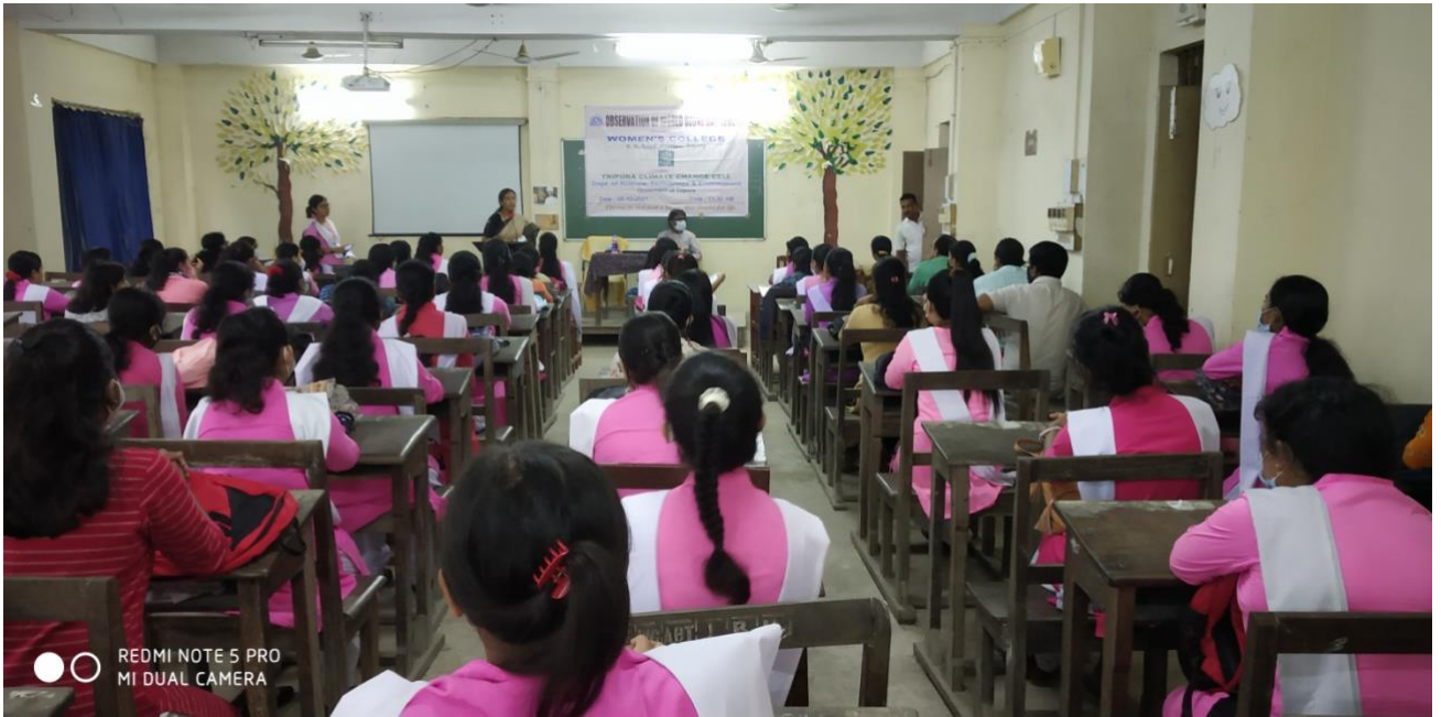
Figure 12: Observance of World Ozone Day 2021.