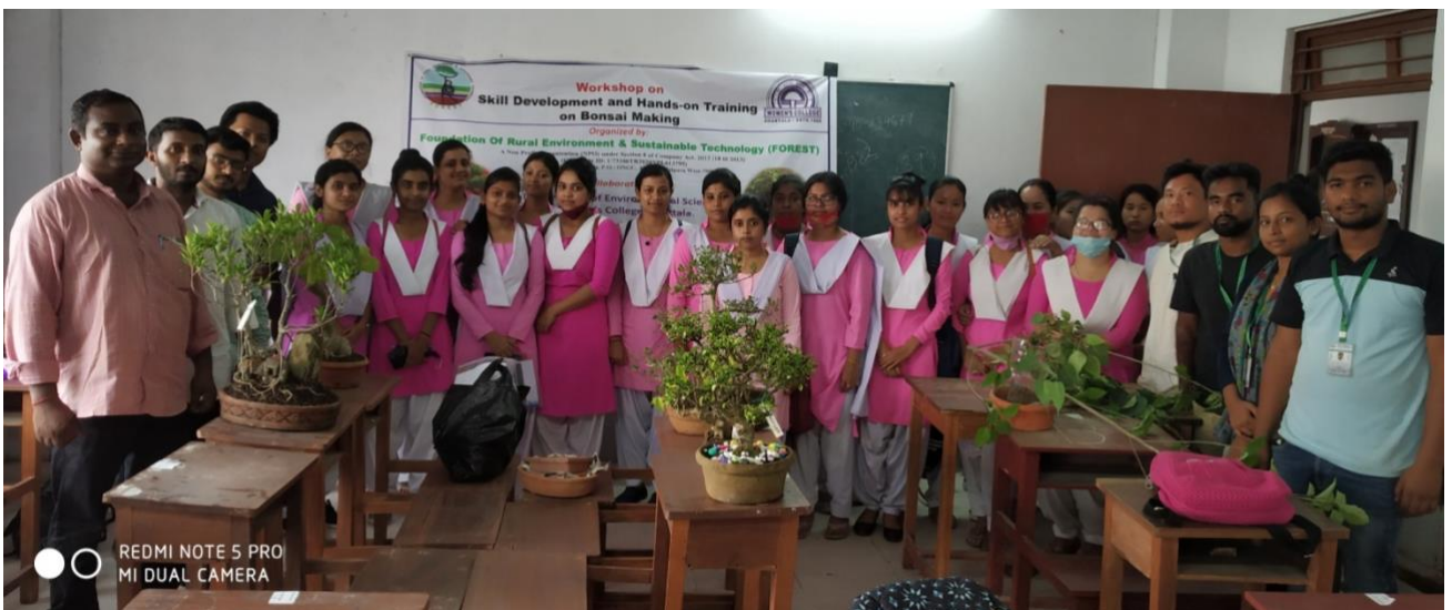
Figure11: Hands on Training on Bonsai Making.