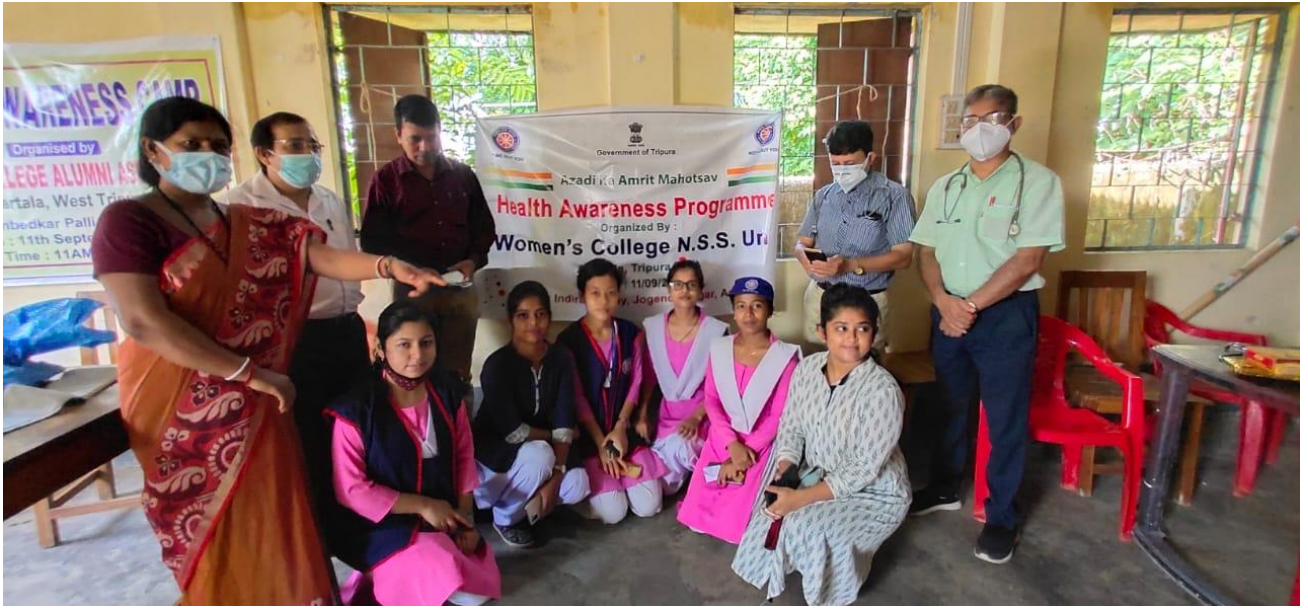
Figure 4 Health Awareness cum Medical Camp