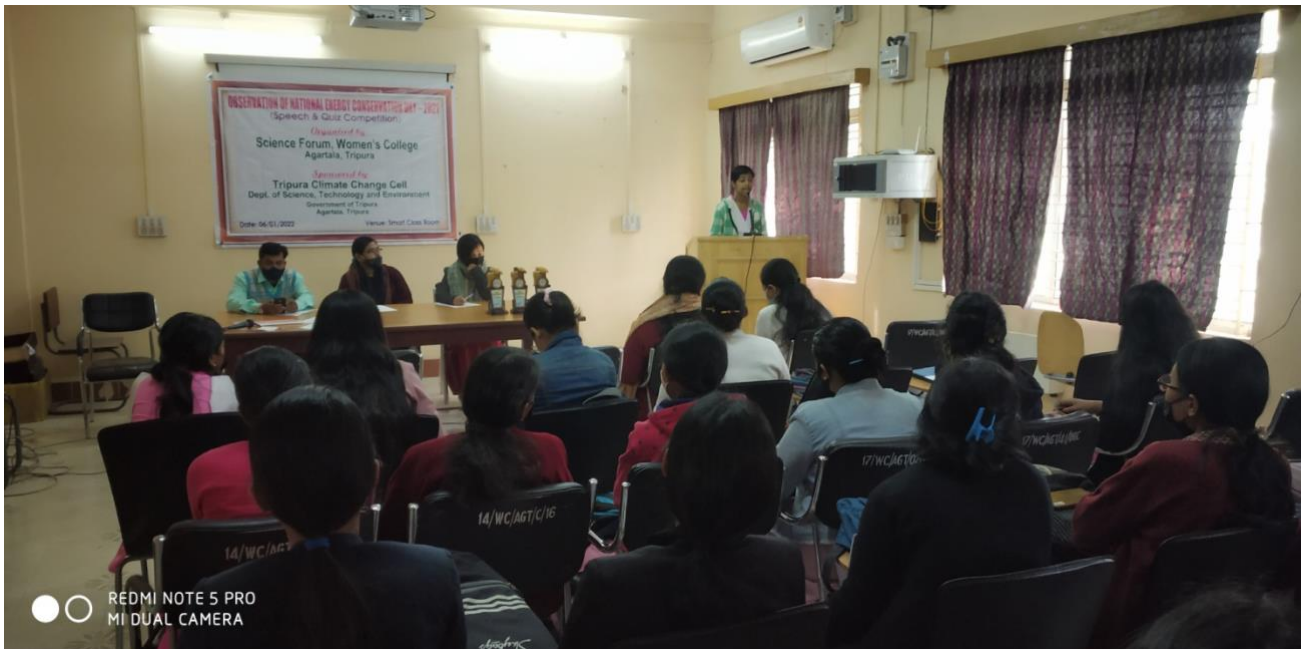
Figure 15: Speech Competition on Energy Conservation.