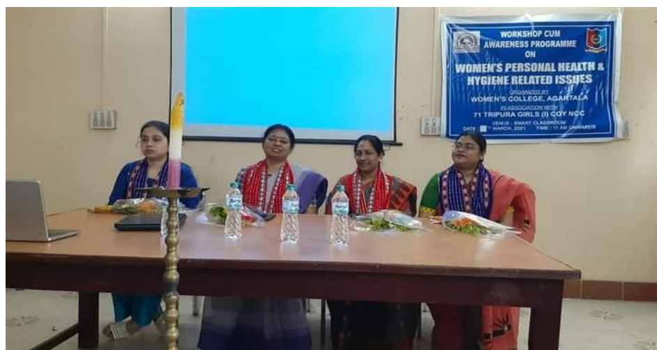
Figure 3 Workshop cum awareness programme on women helath and Hygiene.