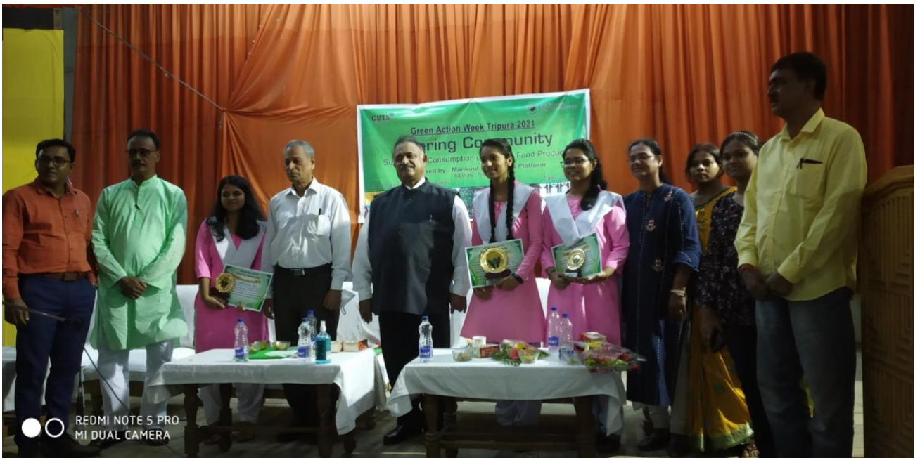
Figure 13: Prize Distribution for Essay Writing contest.