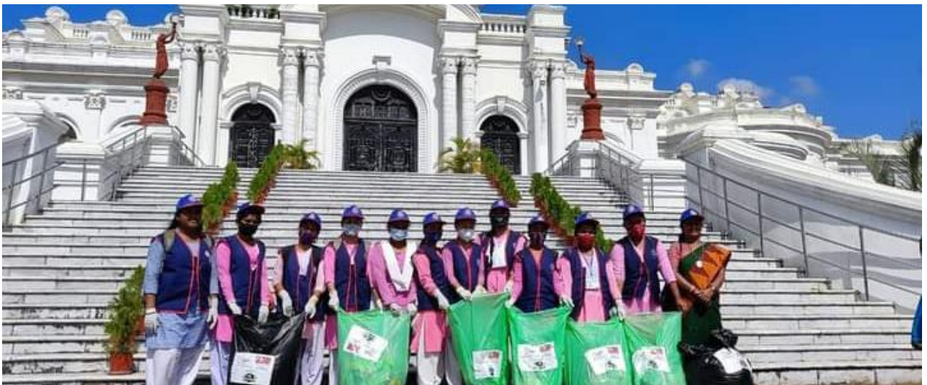
Figure 10: Cleaning of Ujjayanta palace.