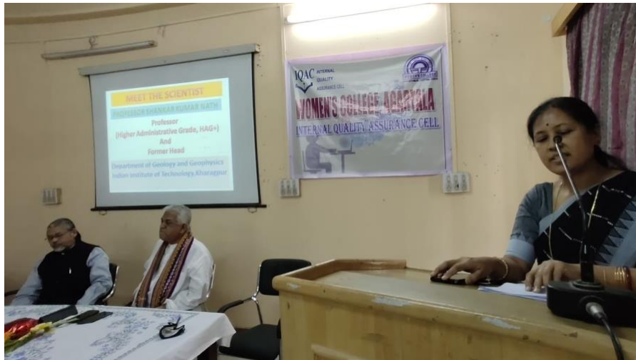
Figure 5 Meet the Scientist programme