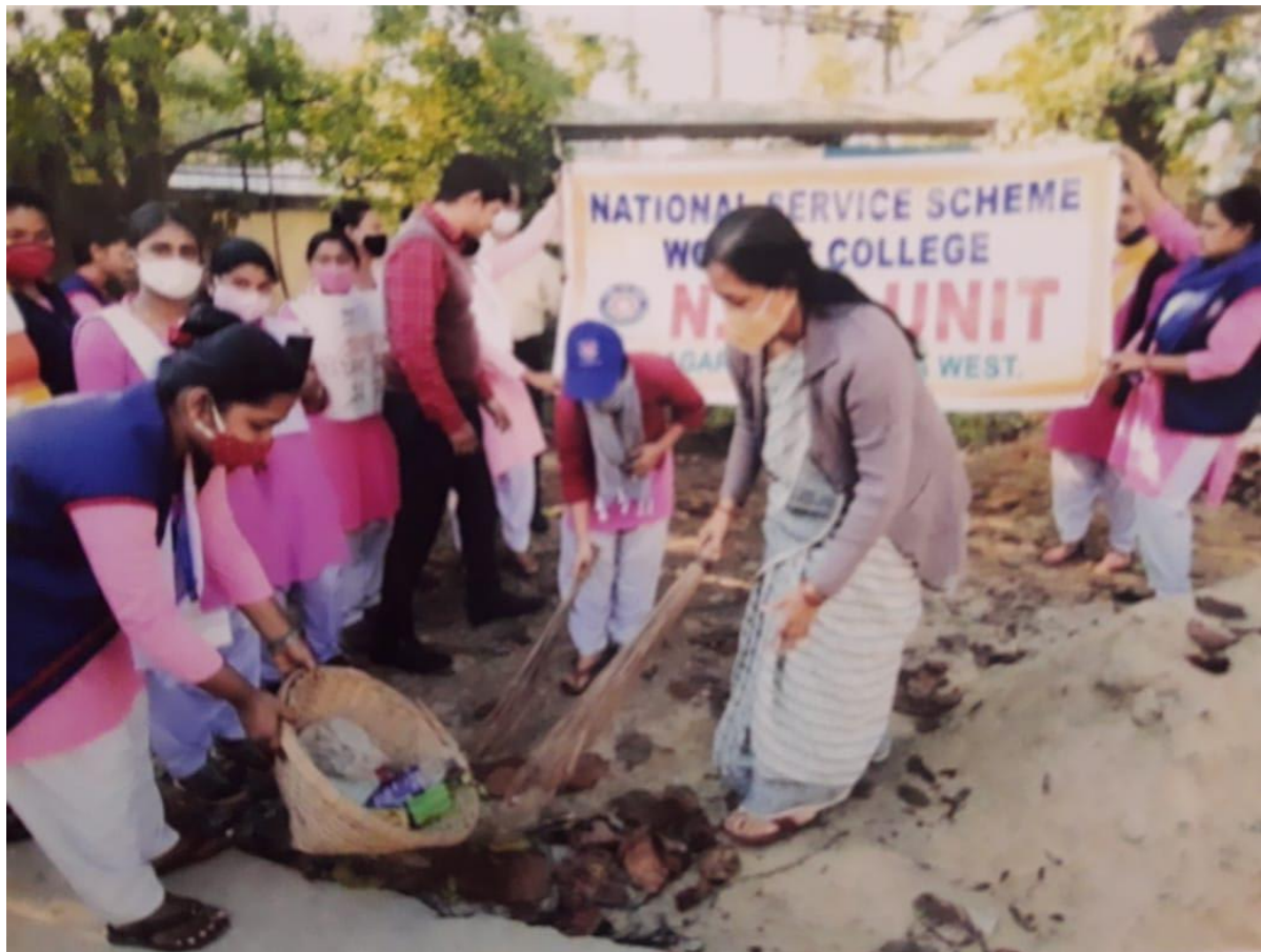
Figure 8 Participation of Principal in Campus cleaning.