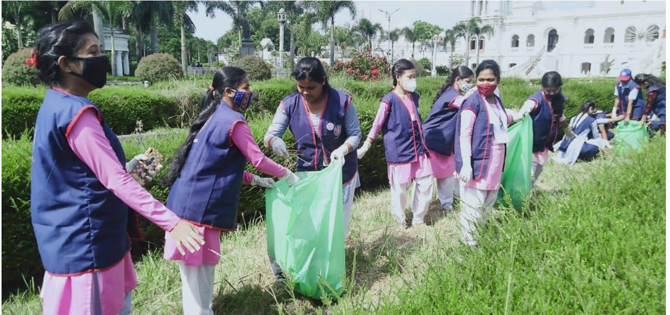
Figure 9: Cleaning of Ujjayanta Palace garden.