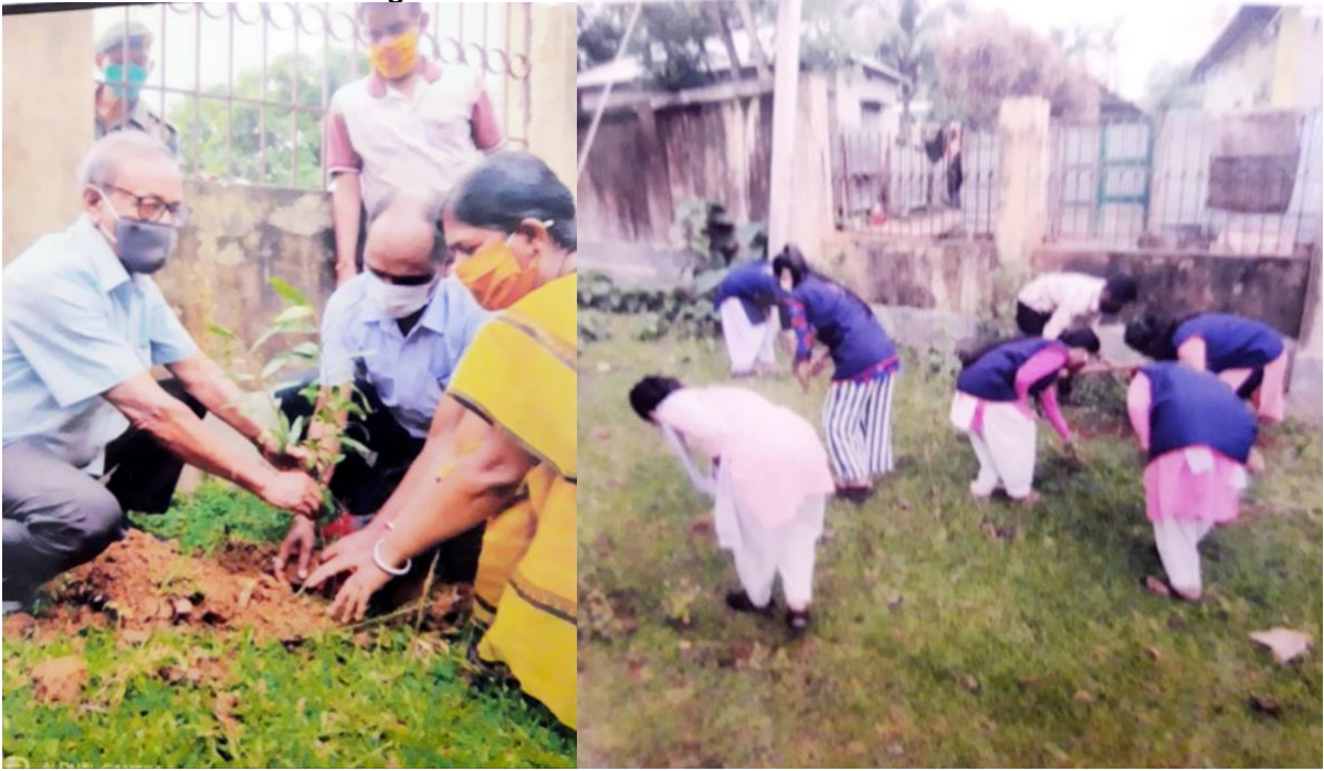
Figure 7 Plantation and cleaning activities at adopted village.