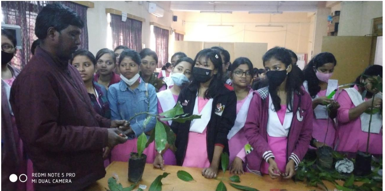
Figure 14: Hand on Training on Grafting Techniques.